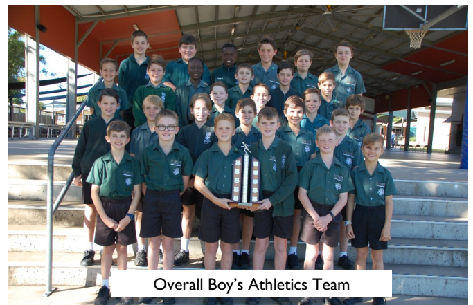
Overall Boy's Athletics Team