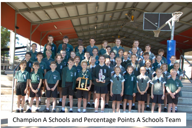
Champion A Schools and Percentage Points A Schools Team