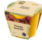
Tomato seed kit