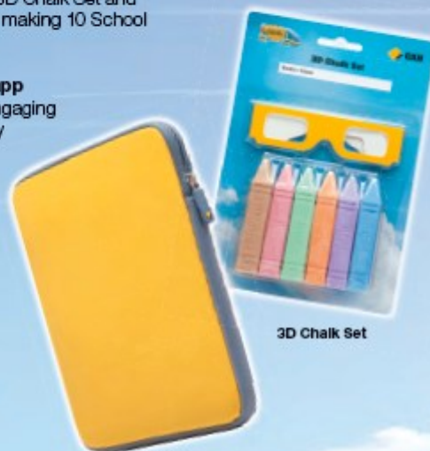
3D Chalk Set

Did you know that approximately one in five parents are trying to teach their children about cashless transactions and digital money management? CommBank research shows parents are alternating between cash and online bank transfers when giving their children pocket money, and actively demonstrating 'tap and go', online banking, mobile applications and how ATMs work. For more information and tips on financial education for kids, visit The Beanstalk on commbank.com.au/beanstalk