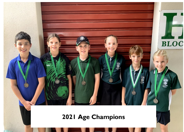
2021 Age Champions