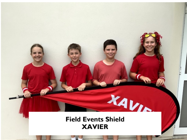
Field Events Shield XAVIER