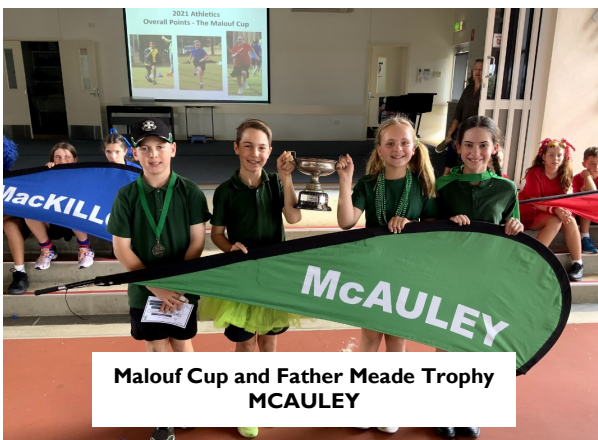
Malouf Cup and Father Meade Trophy