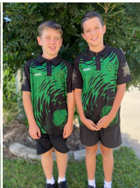
RUGBY LEAGUE WIDE BAY REPRESENTATIVES