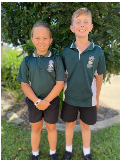
HOCKEY WIDE BAY REPRESENTATIVE