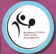
Table Tennis Centre Kendalls Rd Ph 41552388 bundytt@bigpond.com www.bundytt.org.au