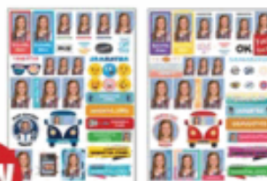
48 Personalised Stickers

Please note: Traditional, Composite or High-Resolution Virtual Group format is chosen by your school. Sibling photos, if available, can also be ordered online and must be ordered prior to your photo day. A late fee will apply for photos purchased after ordering has closed.