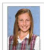
Perfect for 10x8" Frames